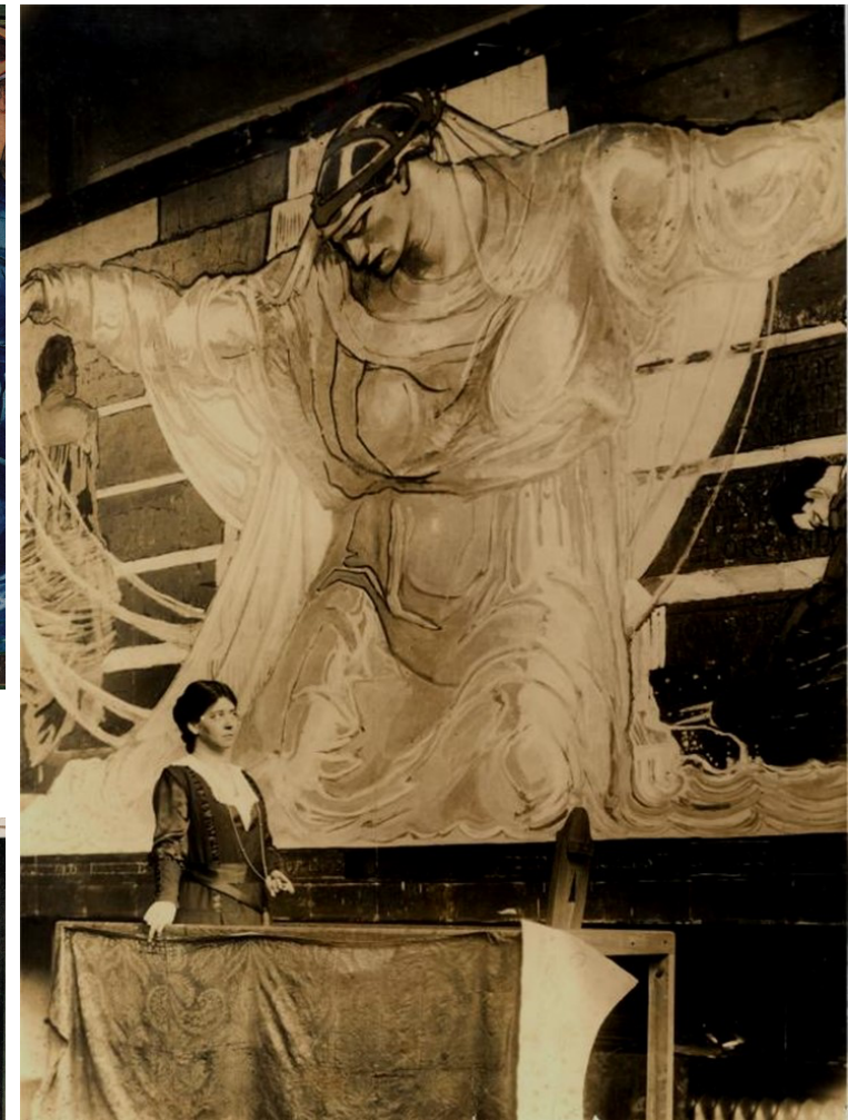
Violet Oakley in front of the Blue Lady at the unveiling of the Unity mural in the Senate Chamber of the PA State Capitol on Lincoln's birthday, Feb. 12, 1916.